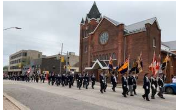
A beautiful day for a parade with colour banners flying and lots of blues and greys