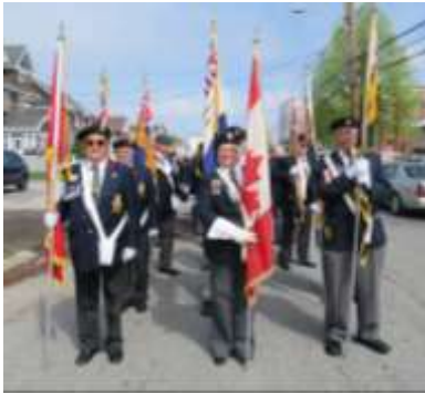
District C Colour Party ready to parade