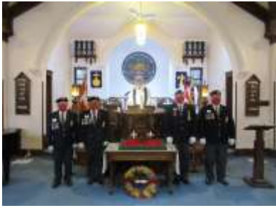
Branch 340 participates in the Tolmie Memorial Presbyterian Remembrance Day Church Service