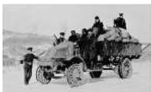
WWI Canadian Army Soldiers in Siberia - Winter 1918-1919

The troops remained in Siberia until June 1919. While there was considerable positioning and numerous discussions with the Russians, the Canadian Contingent was never operationally engaged. On departure, the Japanese gifted the Canadians 96 bottles of wine, 18 bottles of whiskey and 3 casks of sake in acknowledgement of their efforts.