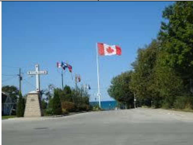
More residents sign the big Canadian flag which will be flown from the big flag pole in Southampton.