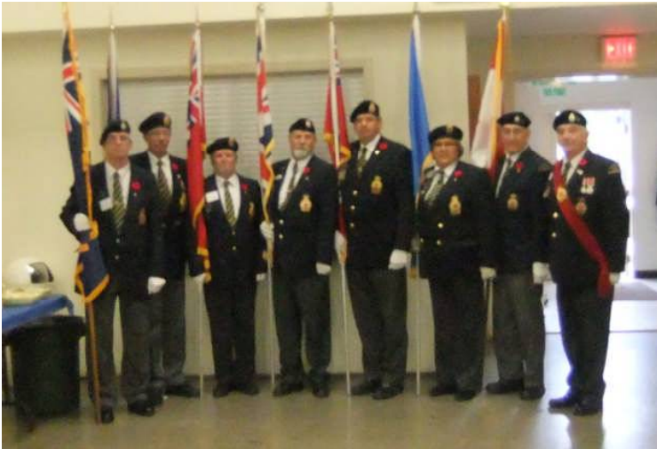
District "C" Colour Party