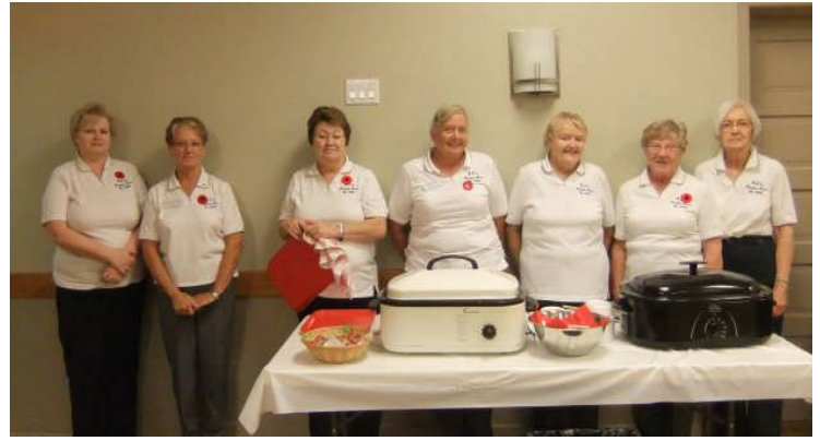
We are very appreciative of the generous luncheon which was served by the Ladies Auxiliary. Thank you Ladies...it was delicious!