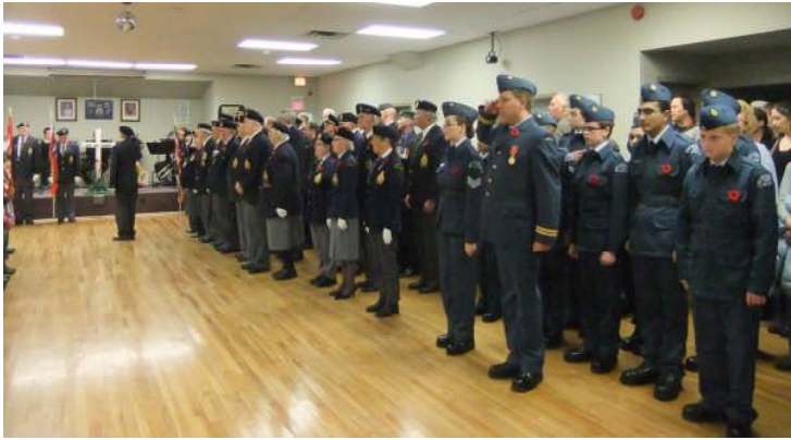
This year the service was held indoors due to the weather. The hall was filled capacity and the Canteen Lounge was opened to the public so all could join us.