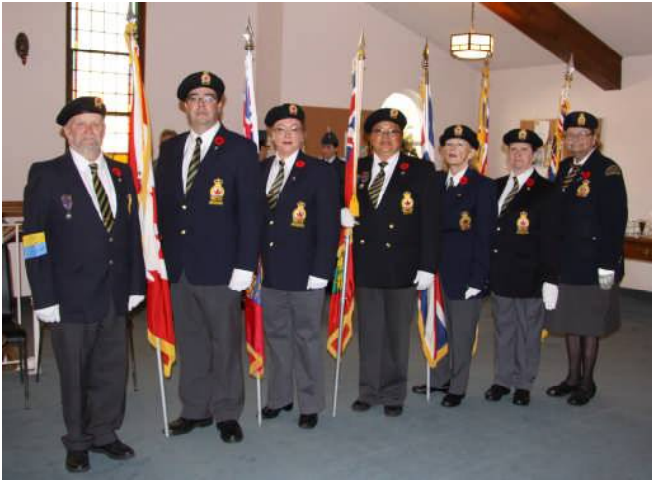
The Colour Party participated at the Remembrance Day Church Service on November 10 th .